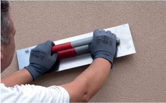
5. Smooth the PX-20 Isolxtrem RTX L.