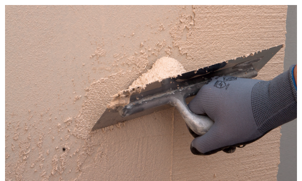
4. Apply PX-20 Isolxtrem RTX Lon the surface.