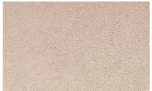
10. Final finishing of the PX-20 Isolxtrem RTX L.