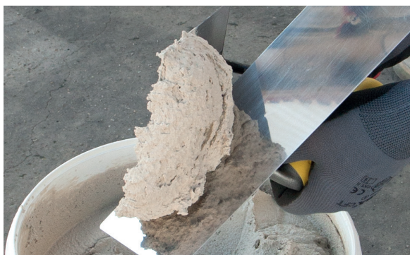
3. Place PX-20 Isolxtrem RTX L on the trowel.