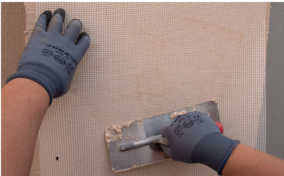
7. Lay the RG-116 Isolxtrem System mesh.