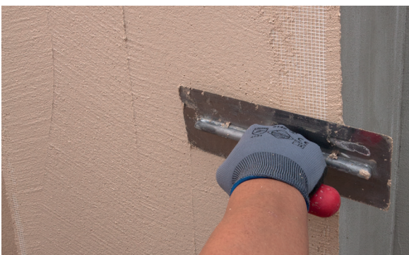
9. Smooth the PX-20 Isolxtrem RTX L deposited on the mesh.