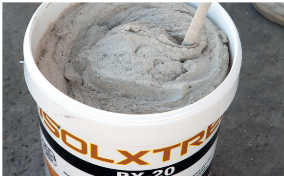
1. Remove the PX-20 Isolxtrem RTX L before use.

If you wish to use the product as an anti-cracking system, apply an initial coat of PX-20 Isolxtrem RTX (see photo no. 4) and without letting it dry, position the RG-116 Isolxtrem System reinforcing mesh, pressing it lightly with the help of a spatula or with the same trowel, making it penetrate the first coat of PX-20 Isolxtrem RTX, (see photo no. 7) and then apply another coat of product fresh-on-fresh that covers it completely (see photos no. 8 and 9). Finally, float the product, (see photo no. 6), leaving a flat, waterproof and decorated surface. (See photo on page 10).