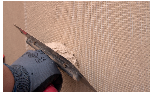
8. Cover the screen with PX-20 Isolxtrem RTX L.