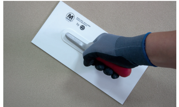
6. Trowel the PX-20 Isolxtrem RTX L.