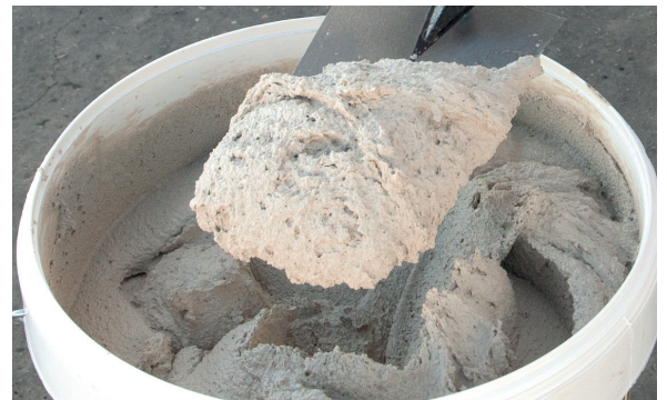
2. Remove the PX-20 Isolxtrem RTX L with the help of a pallet.